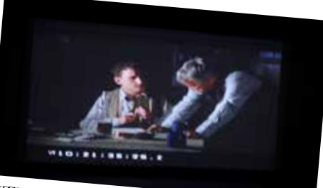
"The Englishman's Boy" Minds Eye Ent.