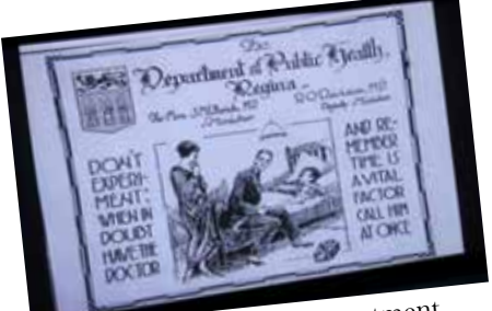
Provincial Health Department