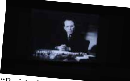
"Prairie Giant" Minds Eye Ent.