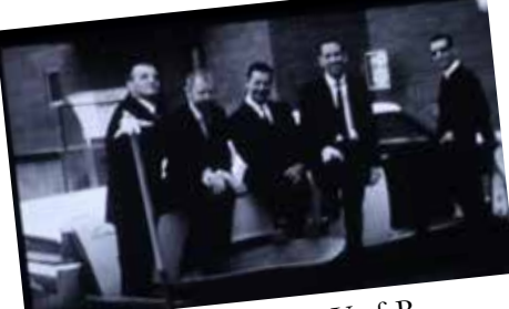
"The Regina 5"- U of R