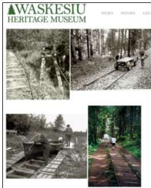
Selected view of the rail portage at Prince Albert National Park.

Historic photos of a rail portage system built in Prince Albert National Park shows an ingenious way to move a large heavy canoe or motor boat up a steep hillside. These images show the importance of documenting our recent as well as our distant past heritage.