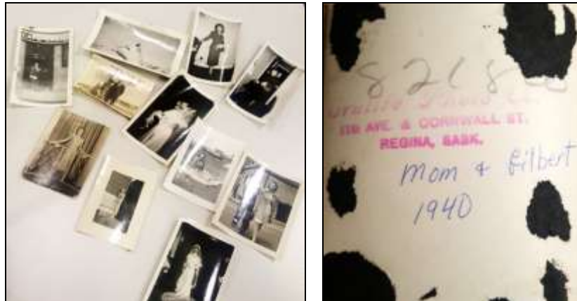
Unidentified wedding photos possibly taken in Regina in 1940.